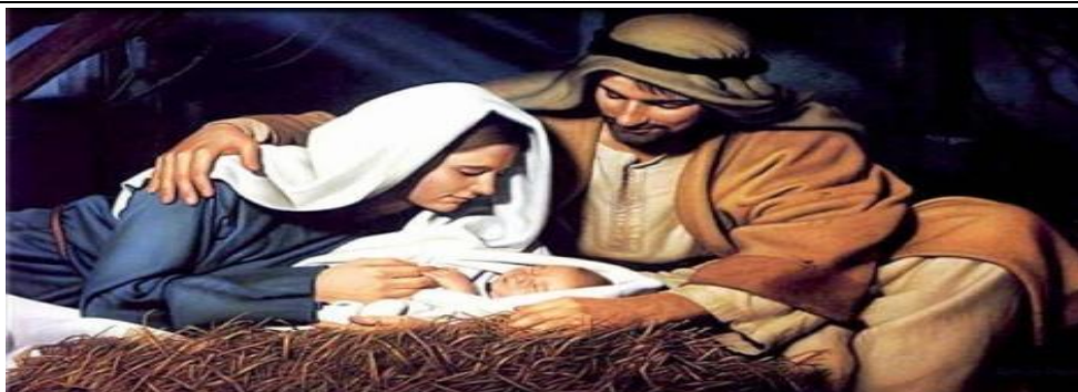
SECOND SUNDAY OF ADVENT DECEMBER 8, 2024

LITURGICAL REFLECTION... The Word has become flesh and dwells among us. This Christmas Day Christians celebrate the mystery of the eternal Word of God becoming one like us in all things but sin. The Eternal Word lived on this earth, to reveal to us the great love of God. God who has no beginning or end has arrived as an infant in a manger. We are filled with awe as we attempt to understand the mystery of this birth. Angels and shepherds sing Christmas praise. We join in singing- Glory to God in the highest and peace to people of good will!